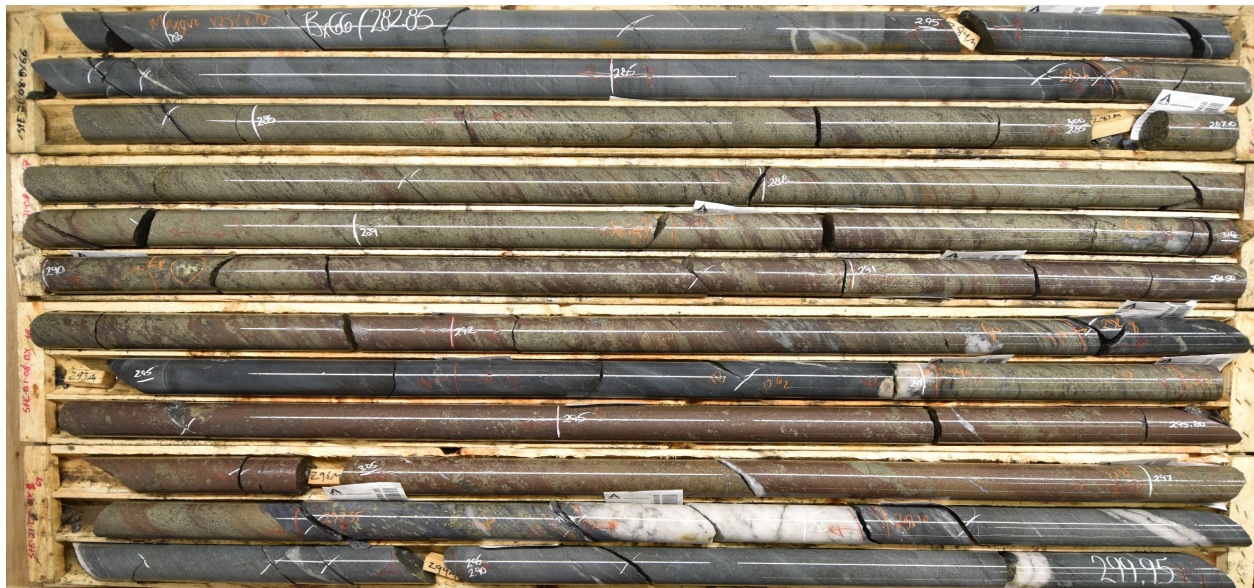
Photo 1: STE-21-08; 285.85m to 299.95m. Massive sulfide mineralization, occurring from 285.60 to 297.70 m, composed of dominantly pyrite and sphalerite with lesser chalcopyrite and galena.