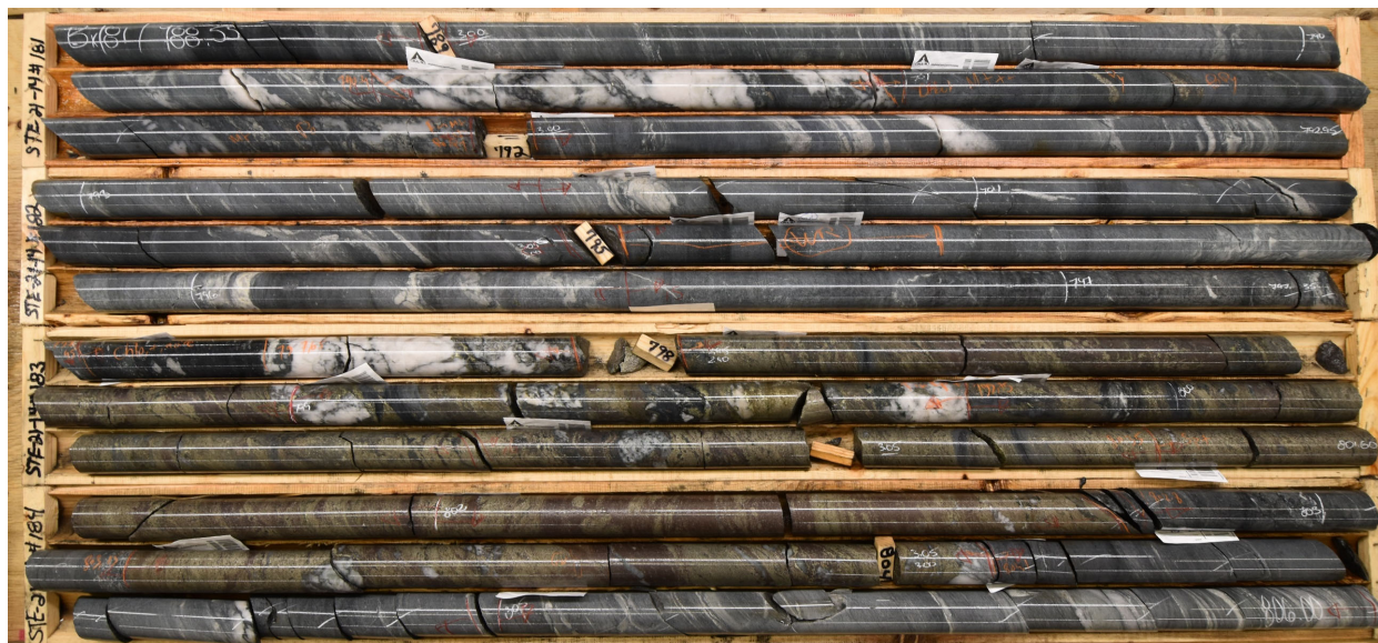
Photo 2: STE-21-14; 788.55m to 806.00m. Massive sulfide mineralization, occurring from 798.0 to 804.10 m, composed of dominantly pyrite and sphalerite with lesser chalcopyrite and galena.

The latest deep hole, STE-21-14 ( Figure 2 ), has intersected a new zone composed of 6.10 m of massive sulphides with estimated sulphide content of 15-20% sphalerite and 0.5-1% chalcopyrite ( Photo 2 ) for which assays are pending. Owing to the targeting success of previous BHEM surveys, the Company completed an additional BHEM survey on hole STE-21-14. This survey indicates that this new massive sulfide intersection is located at the edge of a BHEM anomaly plate, labelled P3a, in an open area without any previous drilling information ( Figure 2 ). The P3a plate anomaly is characterized by a high conductance of 1500 Siemens and has a modelled dimension of 85 m by 100 m. Plates P3b and P3c, respectively 200 and 100 siemens, have also been defined by the same geophysical survey. The Company will continue to complete additional BHEM surveys as warranted as it appears to be a very robust targeting tool.